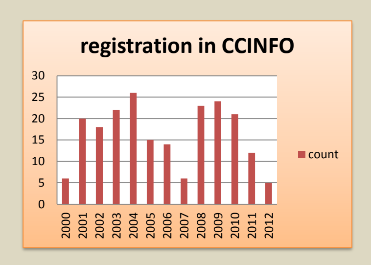
Fig.1: Statistics of registration of culture collections since 2000